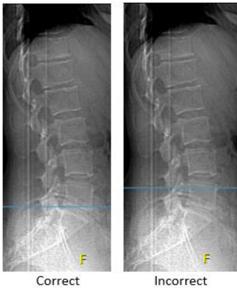
Example of reference line placement difference in an affected study